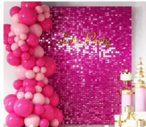
HOT PINK SHIMMER WALL Hot Pink Shimmer Panels With Metal Arch 8ftx8ft $250.00 Full Day Rental

Please note that Balloon Garlands, florals, and neon signs are not included.