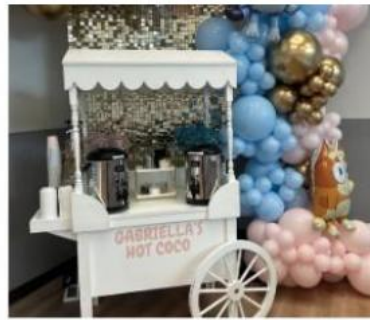
HOT COCO & COFFEE CART White Cart Rental With Cups & Beverage warmer Not including Backdrop, balloons or Personalized Vinyl