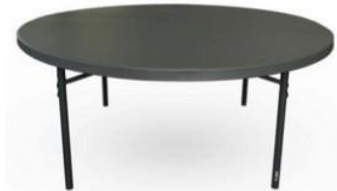
FOLDING TABLE ROUND 71" Grey (6ft) $17.00