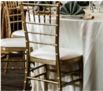
GOLD CHIAVARI & WHITE SEATING PAD $6.00