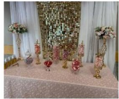
CANDY DISPLAY RENTAL Candy Jars & Tongs Only