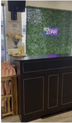
Bar + Backdrop Neon Package Rental (Mon–Thurs) $485.00 Rental (Friday–Sunday) $585.00

*Please note that pricing may vary depending on availability, design, and event requirements