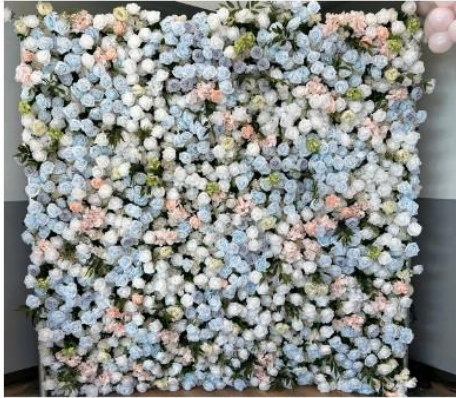
BLUE MIST ROSE WALL Mix of Blue, White, Blush 8ftx8ft $315.00 Full Day Rental