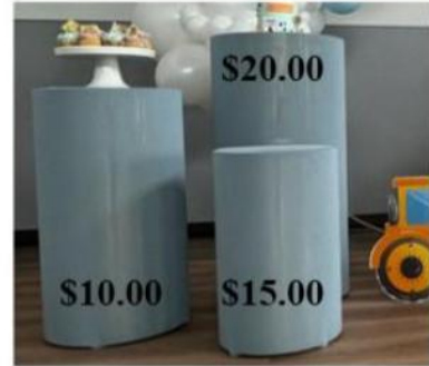
CYLINDER COVERS Spandex Cover in Varies Colours