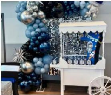
CANDY/DESSERT CART White Cart Rental Not including Backdrop, balloons or Personalized Vinyl