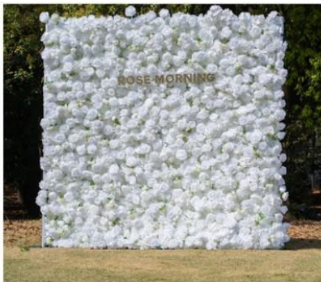
CLASSIC WHITE WALL Luxe White Roses 8ftx8ft $315.00 Full Day Rental (Letters Not Included)