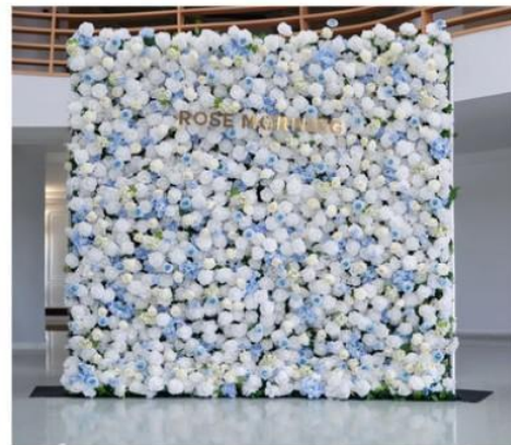
SERENITY ROSE WALL Dreamy White & Baby Blue 8ftx8ft $315.00 Full Day Rental (Letters Not Included)