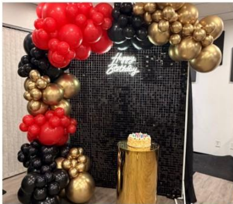
BLACK SHIMMER WALL Black Shimmer Panels With Metal Arch 8ftx8ft $250.00 Full Day Rental