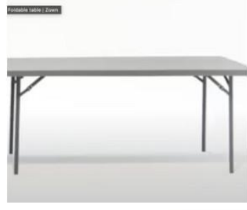
RECTANGULAR FOLDING TABLE 30" X 72" Grey (2.5ft x 6ft) $13.00