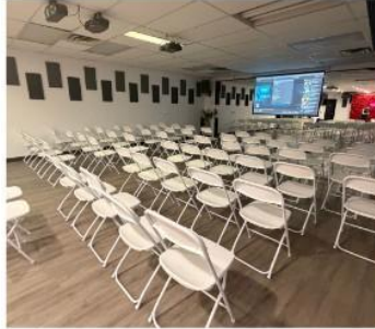
FOLDING WHITE SEAT & WHITE FRAME White $2.00