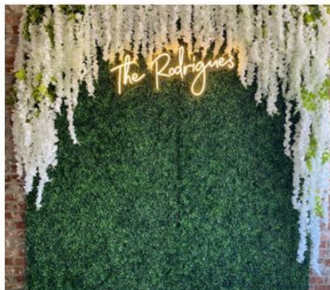
GREEN WALL Artificial Green Grass 5ftx6ft $200.00 Full Day Rental

Please note that Balloon Garlands, florals, and neon signs are not included.