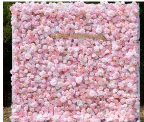
PINK BLOSSOM WALL Elegant Pink & White 8ftx8ft $315.00 Full Day Rental (Letters Not Included)