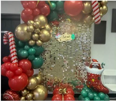
GOLD SHIMMER WALL Gold Shimmer Panels With Metal Arch 8ftx8ft $250.00 Full Day Rental