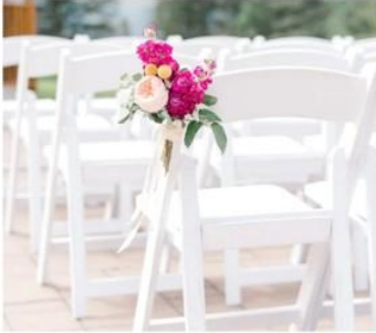
WHITE RESIN FOLDING CHAIR White $3.00