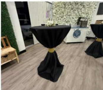
COCKTAIL TABLE RND 30" x 42" High $20.00