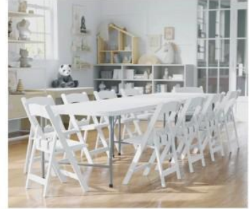
KIDS WHITE RESIN FOLDING CHAIR White $2.50