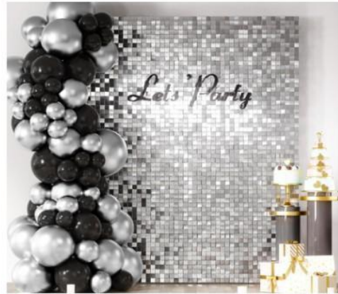
SILVER SHIMMER WALL Silver Shimmer Panels With Metal Arch 8ftx8ft $250.00 Full Day Rental