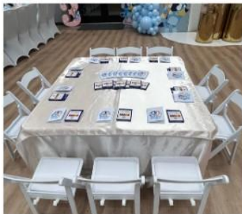
KIDS 4FT FOLDING TABLE White $10.00