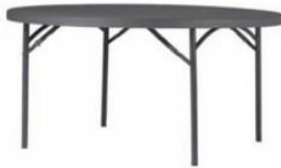
FOLDING TABLE ROUND 60" Grey (5ft) $16.00