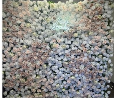
CHAMPANE ROSE WALL Soft White & Nude Roses 8ftx8ft $315.00 Full Day Rental (Neon Sign Not Included)