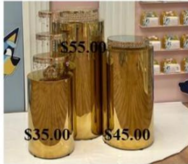
GOLD CYLINDERS Luxury Pedestal Cylinders