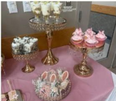
DESSERT STANDS RENTAL Prices Varies Staring from