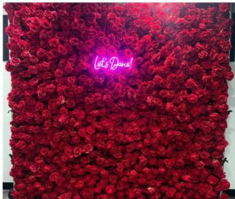
CRIMSON ROSE WALL Vibrant Red Roses 8ftx8ft $315.00 Full Day Rental (Neon Sign Not Included)